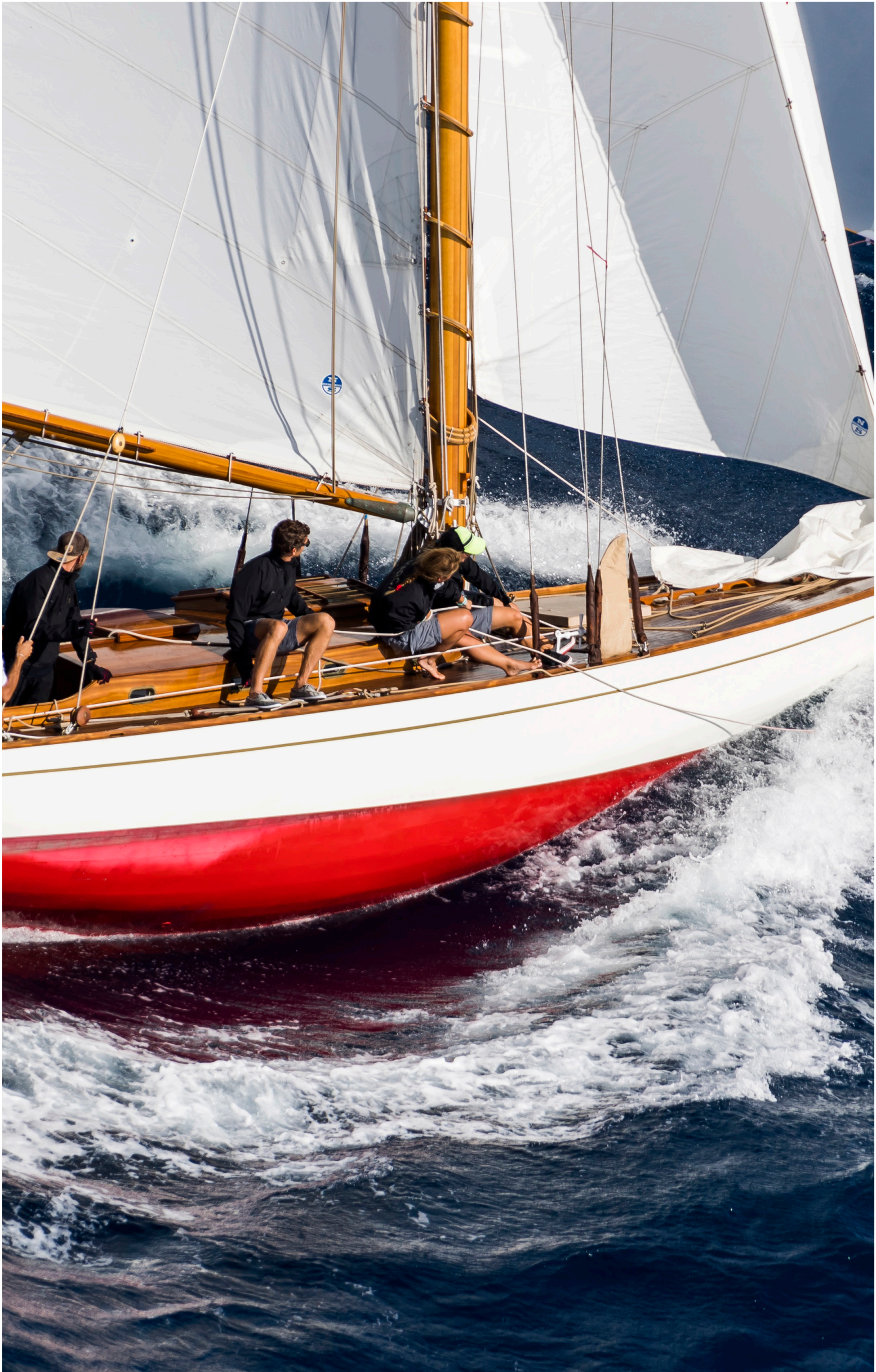
The spirit of Les Voiles de Saint-Tropez, where riviera style and sailing tradition converge.