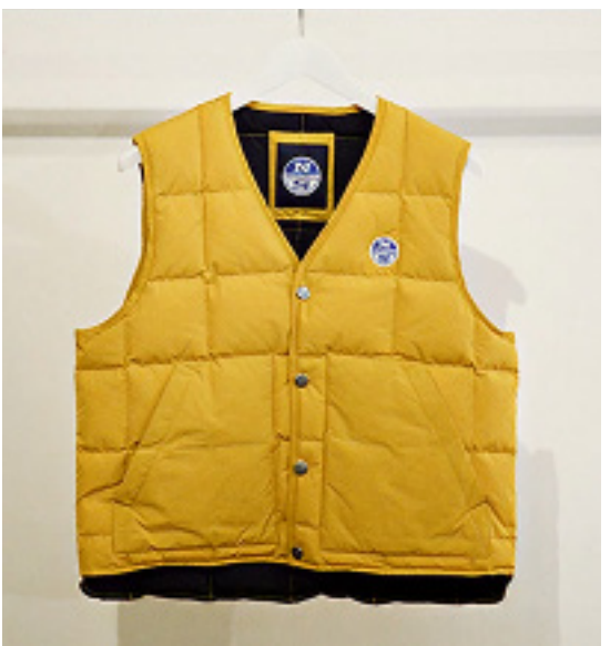
THE MID VEST

Originally designed for New York firefighters, the Scirocco Jacket stood out for its bold yellow color and durable waxed cotton. We’ve reimagined it with a sharper fit and modern-day function—finished with the ST25 mark, a tribute to the legends who shaped sailing history in St Tropez.